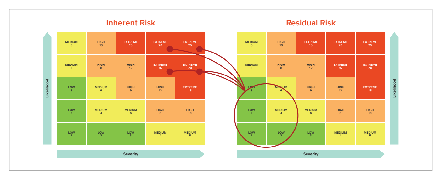
Figure 2. Example change in risk with Quest